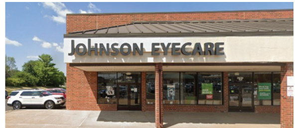
Johnson Eyecare newest location at 2828 West Locust Street, just across from the fairgrounds.