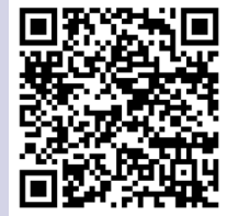
Davenport School District Website