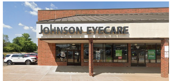
Johnson Eyecare newest location at 2828 West Locust Street, just across from the fairgrounds.