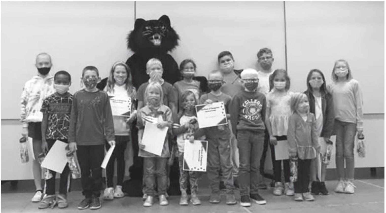
Congratulations to all the Walcott students who received a PAWS award for demonstrating Positive and Prompt behavior during the first quarter.