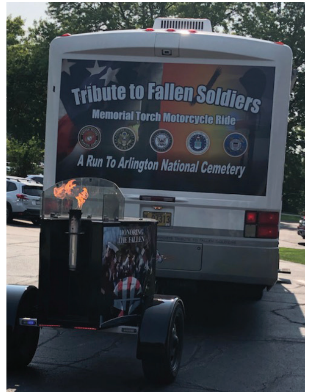
Memorial Torch Ride, Tribute to Fallen Soldiers