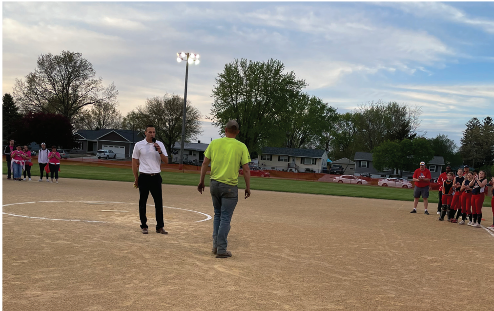
Getting ready for the first pitch.