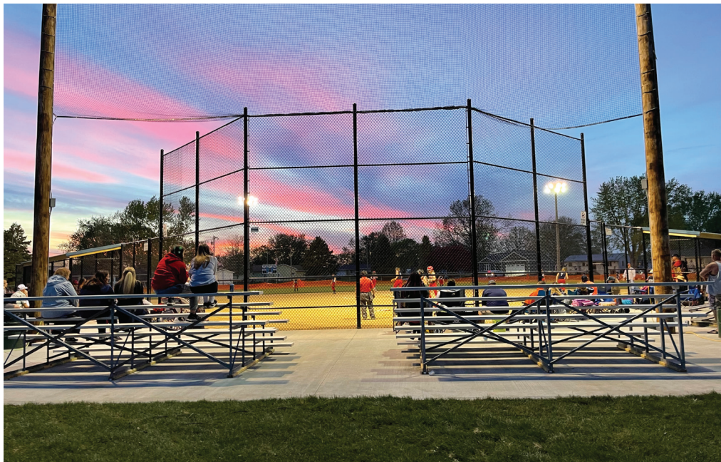
The beautiful, completed site—view from the bleachers at dusk.