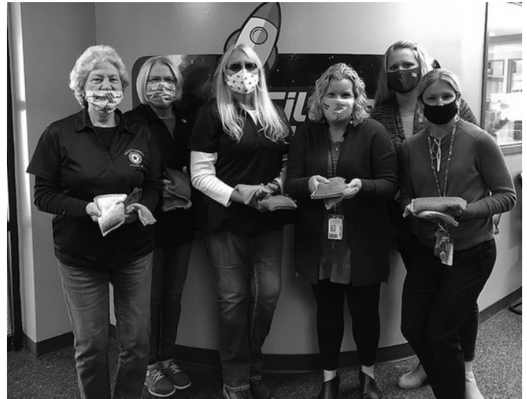
Auxiliary members with Fillmore Elementary School staff.