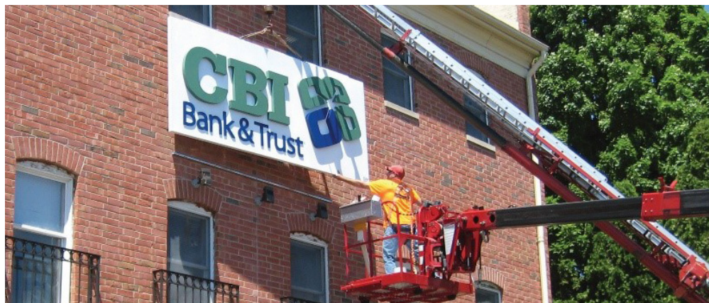
CBI Sign Goes Up at Paul Revere Square Davenport on June 8, 2020.

The merger of Walcott Trust and Savings Bank into CBI Bank & Trust was completed over the weekend of Friday, June 5 through Sunday, June 7, and all customer accounts were converted over to the CBI data processing system.